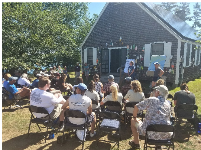
The Eastern Egg Rock research team presents their island summary at GOMSWG meeting: Photo: Huenefeldt

Seabird teams from throughout the Gulf of Maine converged at Hog Island Audubon Camp for the 34th annual GOMSWG (Gulf of Maine Seabird Working Group) meeting on 10 August. Researchers presented island reports on success of each island's bird colonies, availability of forage fish, and predator issues. Additional presentations focused on Maine's Breeding Bird Atlas program, use of satellite tags to track Common Terns, overwintering movements of alcids at Machias Seal Island, and how terns are