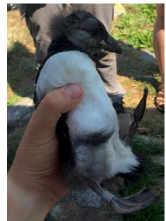
In contrast to 2017, the 2018 puffin fledglings were lighter in weight and most were slow to mature.

Eastern Egg Rock's final active puffin nest count is 178, up 6 pairs from 2017! Despite an abundance of chicks, there has not been an abundance of food for puffins. Chicks are fledging late and are small and underweight. Razorbills and Black Guillemots, on the other hand, who rely on different fish, have had a successful breeding season. Likewise, Common and Arctic Terns across most of the Gulf of Maine were challenged by inclement weather and apparent food shortage. While Roseate and Least Terns had a successful year. Here's hoping for successful migration!