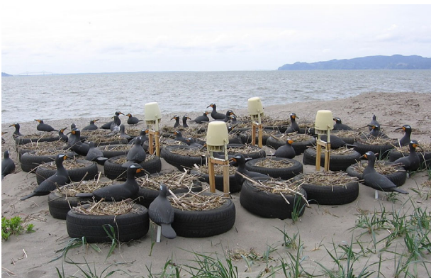
Figure 2. Test plot on Rice Island in the Columbia River (Pacific Northwest, USA) estuary, created in 2006, to attract double-crested cormorants using habitat enhancement and social attraction techniques.

Bald eagles ( Haliaeetus leucocephalus ) caused disturbances to double-crested cormorants nesting on the Rice Island test plot or roosting in the immediate vicinity at a rate of 0.1