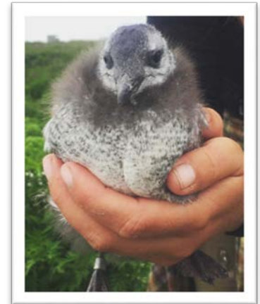
Black Guillemot chick on its way to adult plumage - still sporting a collar of down.

Sightings. The Seal Island team sighted 3 Ruddy Turnstones banded in Delaware and Texas. The team also spotted three jaeger species in one day! Stratton Island's shorebird count found 313 Semipalmated Plovers, 570 Semipalmated Sandpipers, and 86 Willets.