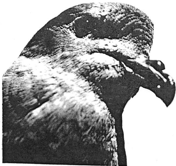
Leach's Storm Petrel, a burrow-dwelling member of the tubenose order, is colonizing artificial puffin burrows at the Cruickshank Sanctuary and is the subject of a new colony formation experiment at nearby Old Hump Ledge.

Leach's Storm-Petrel, a robin-sized member of the albatross order, nests on four islands in Muscongus Bay. This uniformly gray-colored seabird differs from the similar Wilson's Storm-Petrel by its forked tail, flight pattern and North Atlantic breeding distribution. Aside from a small population on one Massachusetts island, the Muscongus Bay colonies occupy the southernmost frontier of the species breeding range in the eastern United States.